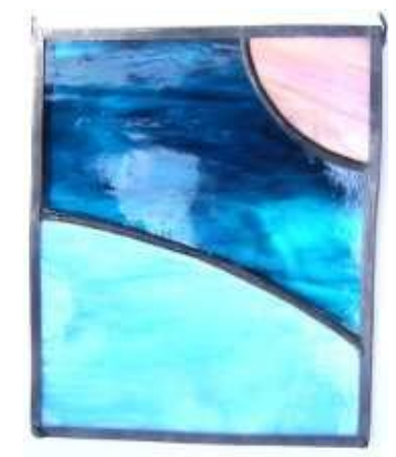
Bob Shaw stained glass - Twin Planets 2

You may have heard that we've had a bit of a shindig over here in Great Britainland known as Loncon 3, the 72nd World Science Fiction Convention.