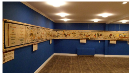
Part of the French Shore Tapestry