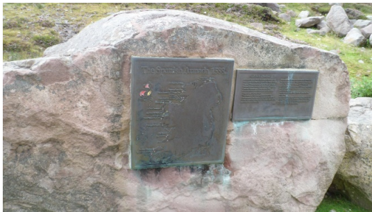
The Spanish trail

hilltop was impressive. We descended the hill as the weather cleared and drove on towards Sligo eventually intercepting the N4, which heads directly there. We checked into the Sligo Southern Hotel. The next morning it was some shopping in Sligo and then out to Carrowmore Megalithic Cemetery. Impressive and possibly the oldest megalithic site in Ireland, but by now we are replete with visiting Ireland's prehistoric sites. So, it's off to Ennis by way of the scenic route: the N59 to Galway, the R548 to Ennis and onwards to the Inn At Dromoland (or the Clare Valley Country Club as GPS would have me believe). The scenery was interesting and varied. At various points there were storyboard signs telling of shipwrecks from the Spanish armada coming ashore along the coast. Equally fascinating were the local sheep (goats?) that had been patches of blue and pink sprayed on their backs. About Maam Cross (before Galway) we had a rest stop. I made a big purchase: a rain jacket. Why I needed one in Ireland I can't say. The shop assistant recommended we stop by Aughnanure Castle. Unfortunately, this was closed when we arrived but it was still worth the visit.