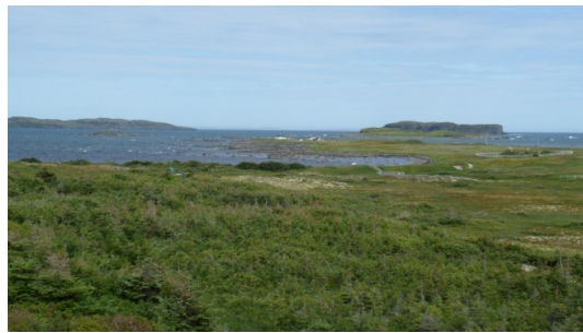
The actual site, with Labrador to the left

On the journey back to Deer Lake we decided to visit Conche, where a 66-metre long tapestry a la the much more famous Bayeux tapestry, had been created recording the history of the French Shore of northern Newfoundland is on display. To get to Conche we took unsealed route 432, turned off down route 433, then turned off again on route 434. Just before the descent to the village there is a lookout point and observation platform giving a fantastic view of the sea-arm and down to the settlement. We weren't disappointed with the tapestry; it was worth the detour. Then back to the car, back along route 434, 433 and we completed the length of 432 to join up with the sealed route 430 again. Deer Lake was a welcome sight. On the drive back to St John's we played a game trying to determine whether any body of water we saw was a lake, a river (not very often) or the sea. Newfoundland has a bleak forested beauty but not much in the way of magnificent vistas. We get back to St John's and have a final finish dinner. Seafood is cheaper than chicken in Newfoundland, even my crab leg dinner was.