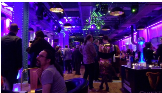
The after match function 2020