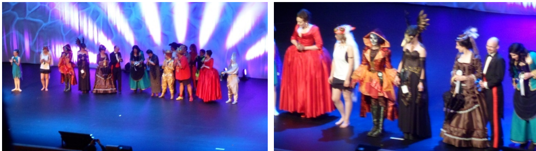
Scenes from the Masquerade