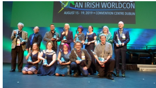
Retro-Hugo award presenters (me front right)