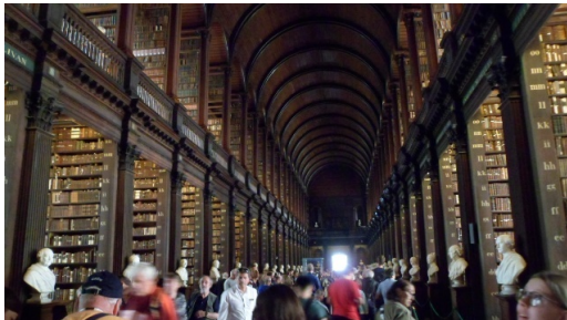
Trinity College Library