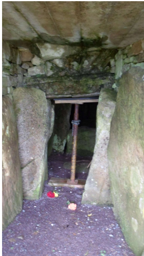
Newgrange neolithic pit prop