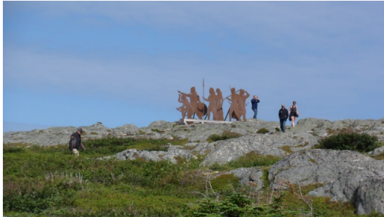
L'Anse aux Meadows