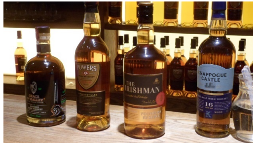
Irish Whiskey Museum – the tasting