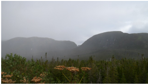
Gros Morne National Park

After collecting the rental car and finding the hotel we spent a while in downtown St John's. We thought the sign for the Dildo Brewery was amusing. The next day was spent exploring the area around the city, taking in some of the historical sites and enjoying the rain blowing in from Greenland. Next followed a two-day drive to L'Anse aux Meadows, overnighting in Deer Lake. At Deer Lake we said farewell to route Canada 1 (which starts in Vancouver and ends in St John's), and took provincial road 430 through the UNESCO-listed Gros Morne National Park, with the St Lawrence seaway to our left. At St Barbe we passed a sign for the ferry across the seaway with estimated distance times. The crossing to Blanc Sablon was about an hour, the joining ferry to Quebec City was given as three days. On the way up the coast, we visited the Port au Choix National Historical Site and Point Riche Lighthouse. They are more or less on the same site. Port au Choix at various times was occupied by various Indian and Eskimo tribes, but the settlements never overlapped. {The local Inuit tribes don't object to the use of the term Eskimo as they are unrelated to the vanished tribes.} As we were about to leave a small herd of caribou walked past the car. A most unexpected sight. Just shy of St Anthony, where route 430 ends we stayed at Viking Lodge with a clear view across the seaway to Labrador.