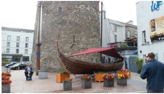
Reginald's Tower, Waterford